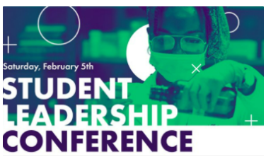
Student Leadership Conference

📅 Friday, February 4 at 7:00PM MST 📍 Education Auditorium