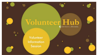
Volunteer Hub Volunteer Information Session

📅 Saturday, February 5 at 12:00PM MST 📍 Medicine Bow National Forest