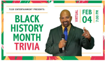
Black History Month Trivia Night

📅 Wednesday, February 2 at 6:00PM MST 📍 Union Family Room