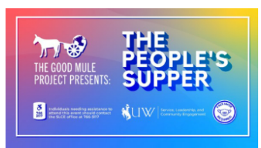
The Good Mule presents: The People's Supper (Managing Diffic...

📅 Tuesday, February 15 at 11:00AM MST 📍 Wyoming Union Ballroom