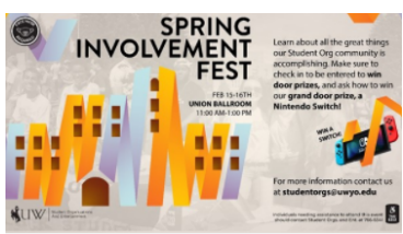
Spring Involvement Fest