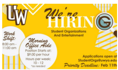
We're Hiring!!-Student Orgs & Entertainment Morning Office Aide

📅 Wednesday, February 9 at 7:00PM MST 📍 The Gardens (union lower level)