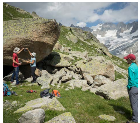
Students in the Alpine Climate & Culture Course set up camera traps in the Alps.

Today's dynamic and shifting educational landscape includes a range of learning environments such as blended classrooms, field laboratories, and digital spaces. Haub School faculty Maggie Bourque and Courtney Carlson recently partnered to study the school's approach to place-based and place-informed environmental education in diverse contexts. They demonstrate how principles of contextuality, relevance, experience, and relationality allow students to learn from their own communities, regardless of students' physical locations. At November's Innovations in Learning conference, Bourque and Carlson shared evidence-based practices, lessons learned, and strategies to magnify student learning using these key principles.