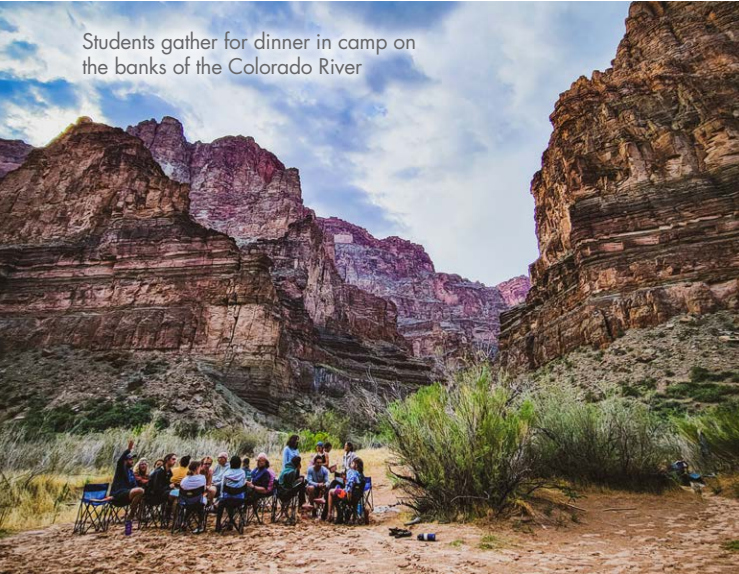
Students gather for dinner in camp on the banks of the Colorado River