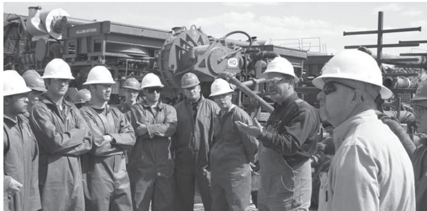
UW Students discussing gas field drilling and production issues with EnCana USA engineers.