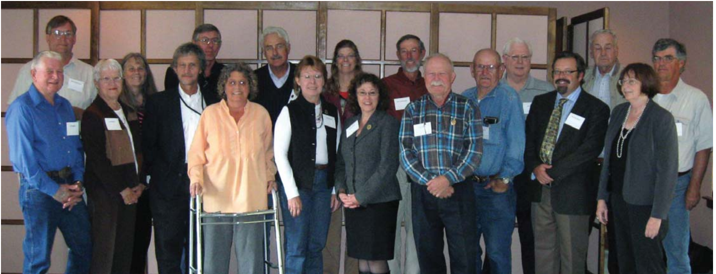
Above: The Board of the Friends of the Frison Institute.