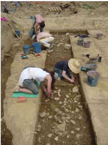
Excavations at La Fosse in France.

The George C. Frison Institute encourages scholars and students to participate in international anthropological research. In past field seasons, students from the University of Rennes 1 have traveled to Wyoming to take part in archaeological research. This particular trip was supported in part by the Frison Institute, and we hope to continue research exchange programs like this one.