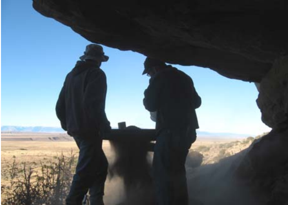
Last Canyon Cave testing.