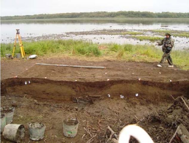
Excavations at the Ushki Lake V site.