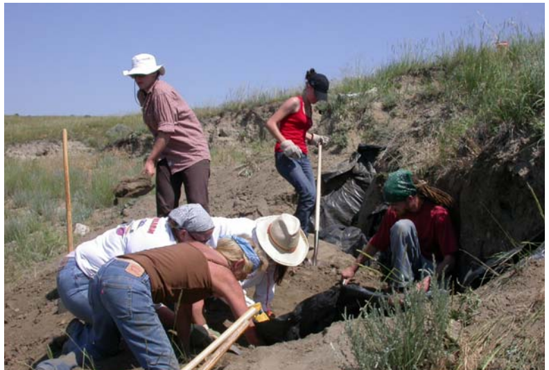
Removing back dirt at Sheaman.

Work in the Agate Basin arroyo consisted of geoarchaeological investigations at the Sheaman site and continued recovery of backdirt fauna from Area 1. The Sheaman site investigation produced a few artifacts (chipped stone and bone), but a great deal of information about the potential extent of the site was gained. The Clovis age sediment appears to continue to the east and northeast and may include 100s m 2 of cultural deposits. Further testing will be required to demonstrate the presence of cultural material. The fauna recovered from Area 1 probably doubled the sample from the Agate Basin bone bed and will be a significant component of the zooarcheological analysis of only the 3 rd known Agate Basin bone bed.