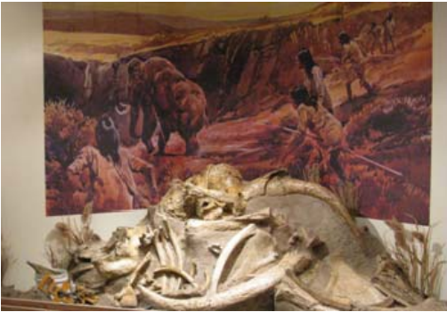
New Colby Mammoth display in the Anthropology Museum.