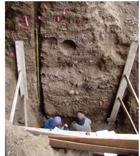
Excavations at Mummy Cave.