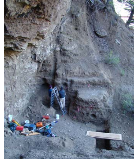
Crew members working at Mummy Cave.

At Two Moon shelter, excavation continued in two test units, one of which is in the Folsom Component and the other is a Mountain/Foothill component. The latter unit probably reached the top of the Folsom component at the end of the field season. Nearly 5 m 2 of the Folsom and Mountain/Foothill components are now ready for spatial and site formation analysis. We look forward to finally beginning to