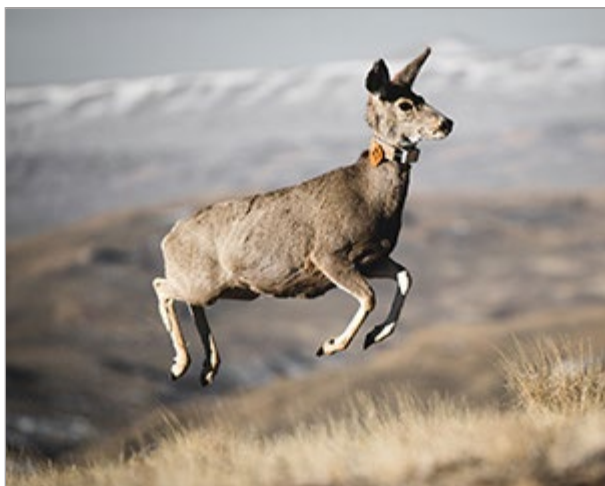
A mule deer doe in the Sublette herd jumps as she is released in the Red Desert while

As wildlife research supervisor with the Idaho Department of Fish and Game, he's currently working with Grand Teton National Park to document migrations across the border between Idaho and Wyoming.