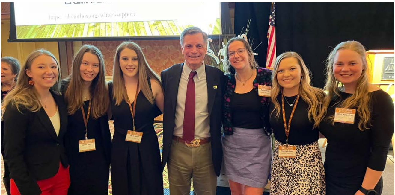
Haub School students with Governor Gordon attending the Wyoming Governor's Hospitality and Tourism Convention, March 2022

In the future, WORTH will continue to expand its impact through extension services to the state, and also tailor economic impact studies for specific projects or funding allocations. These important contributions will aid small business owners around Wyoming by making educational resources and economic data available and more accessible than ever before.